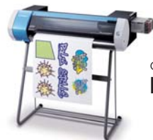
Optional Stand PNS-24

About Metallic Silver Ink Due to the nature of the metallic silver ink, the pigment in this ink will settle in the cartridge and ink flow system, requiring you to shake the cartridge before each use. Outdoor durability is three years for CMYK inks, one to three years for metallic silver ink, depending on the media used. Roland strongly recommends lamination for both indoor and outdoor graphics to ensure the quality of metallic silver ink.